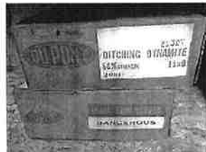
A man called the Polk County Sheriff's Office after he found two cases of dynamite in a shed at a vacant residence in Auburndale, while he was preparing for an estate sale. The Sheriff's Office said it called the Tampa Bay Regional Bomb Team to help dispose of the explosives, which appear to be several decades old.