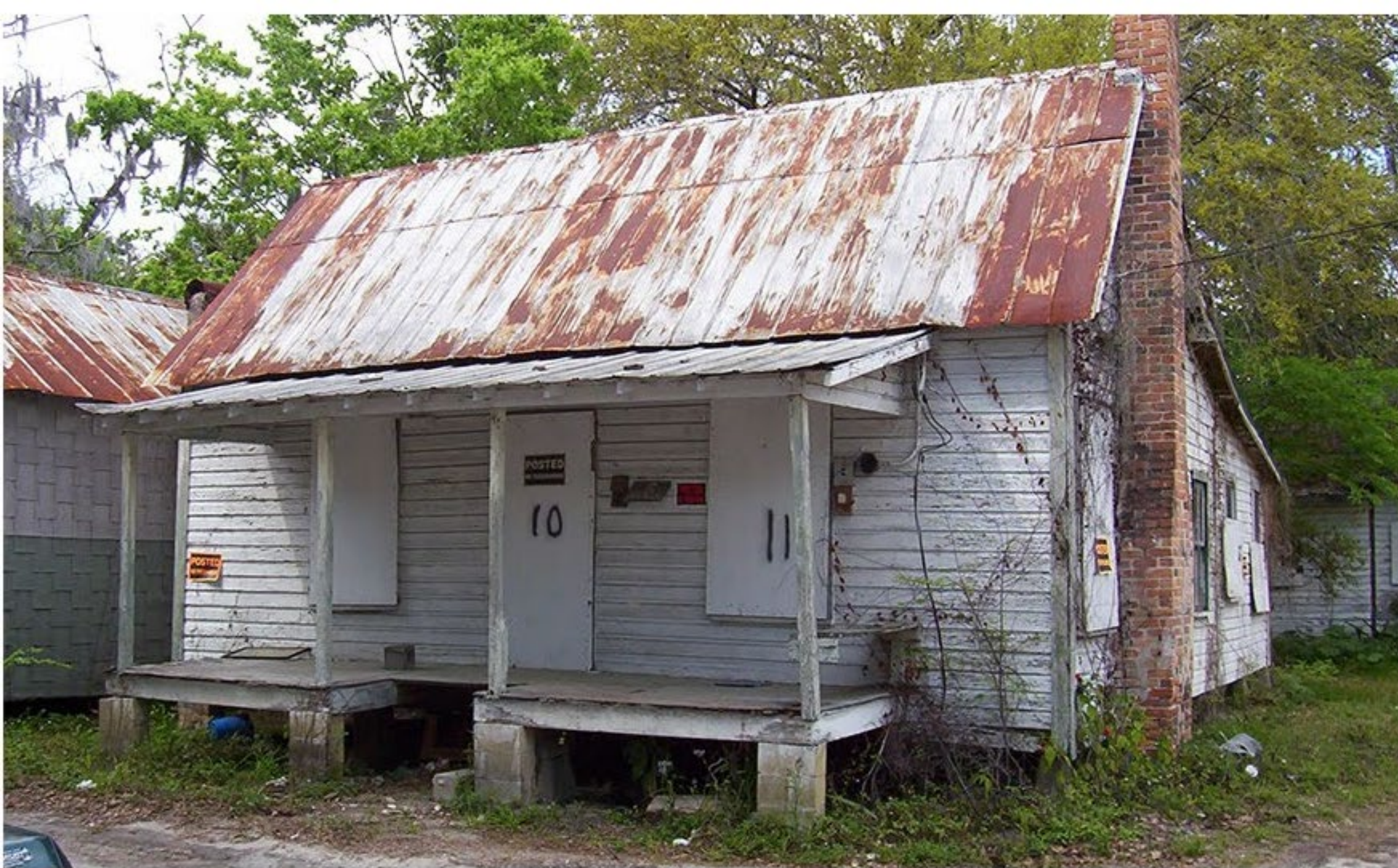
Legistar # 21890 Attachment A