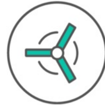
POWER SUPPLY MANAGEMENT