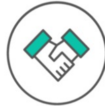
BILATERAL ENERGY TRADING