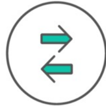
RTO MARKET MANAGEMENT AND TRADING