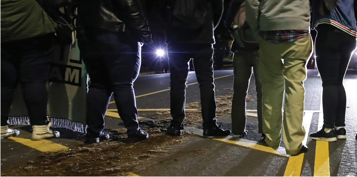
200054_Responding to Racial Tension_20200618