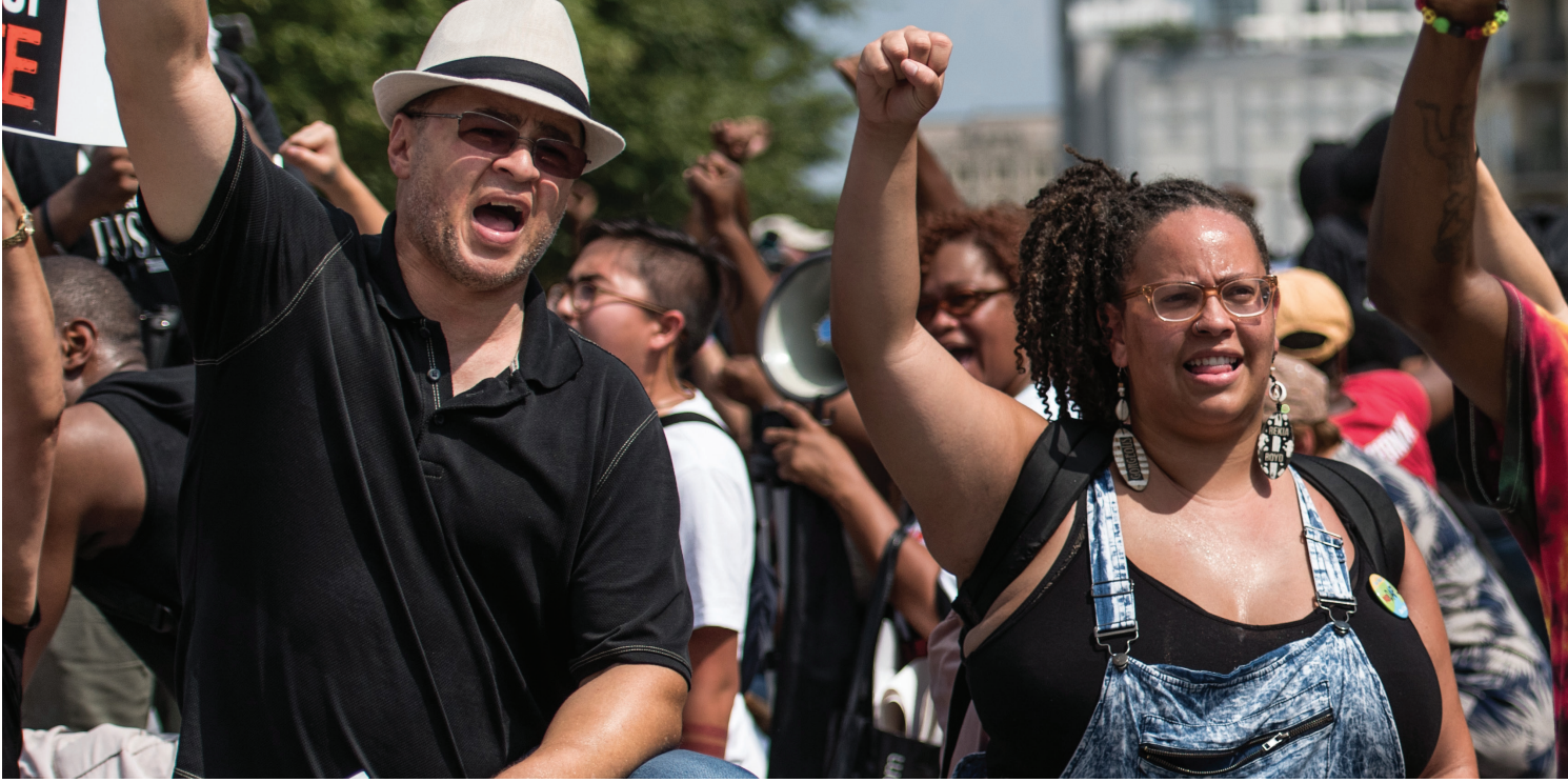
200054_Responding to Racial Tension_20200618