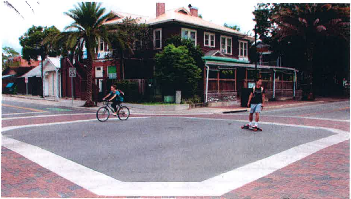
A new bricked intersection with clearer lanes for motorists, cyclists and pedestrians.