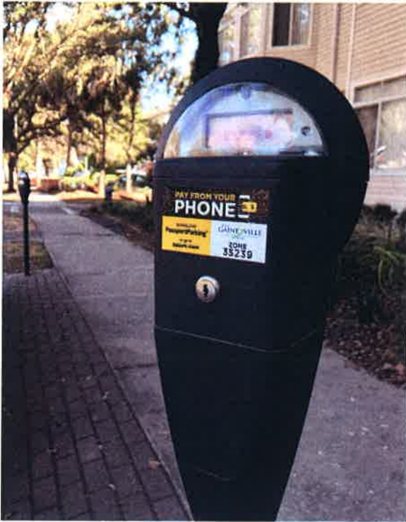
The City of Gainesville's new mobile parking program was implemented on NW 1st Avenue upon completion of the project.