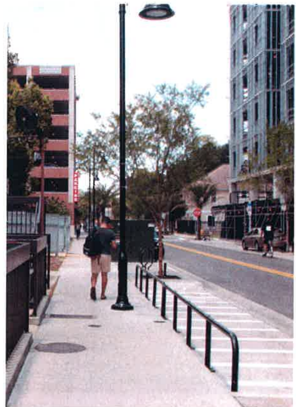
Larger sidewalks with new LED lights.