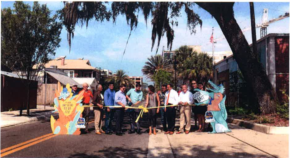
CRA Staff, Stakeholders, City of Gainesville and Alachua County dignitaries at the project completion ceremony.