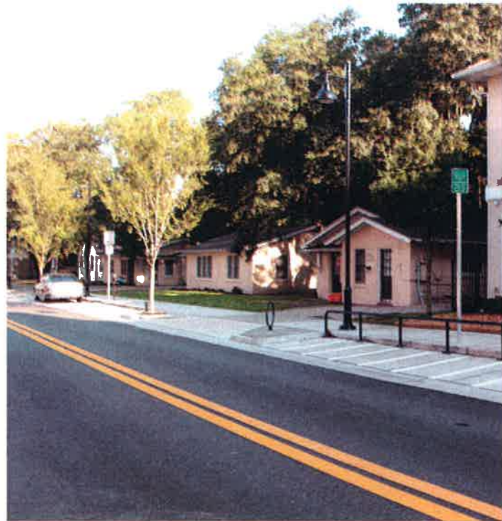
Allee Elm shade trees run along the street.