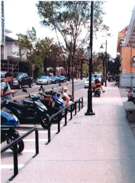
New scooter parking spaces on the street.