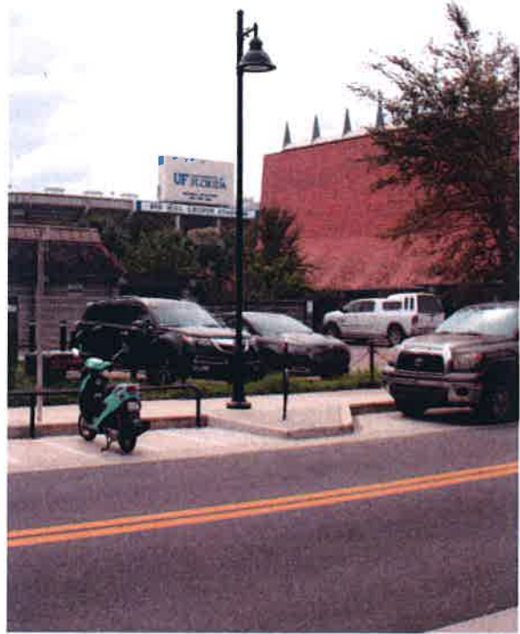
Parking and new bulb outs with scooter parking and bricked curb extension.