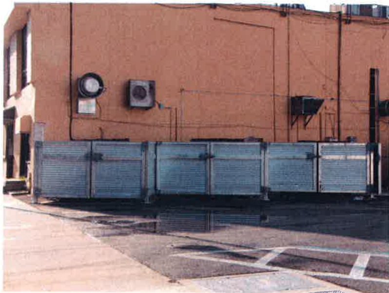
New dumpster enclosures off the street.