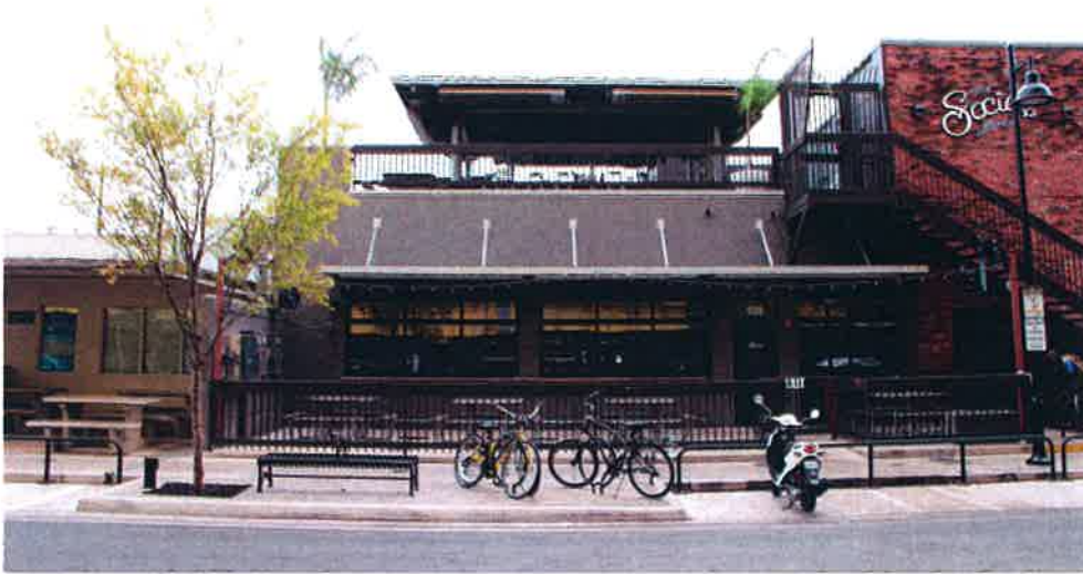
Seen here a collection of new street accessories: a shade tree, bench, bike rack, scooter parking space and LED light.