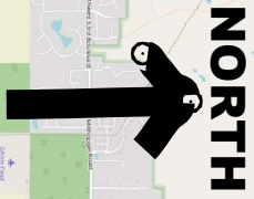
Exhibit A - Ordinance No. 210163