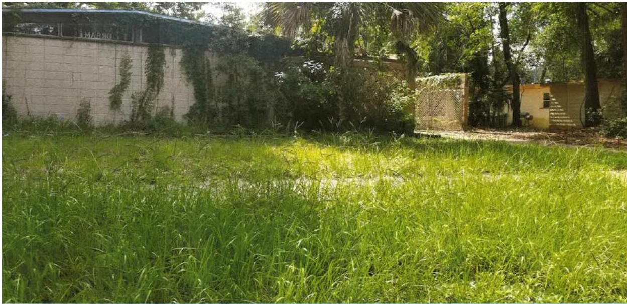
6/19/2020 Before Photo taken by Samantha Norris and accurately reflected the condition of the property at the time it was taken.