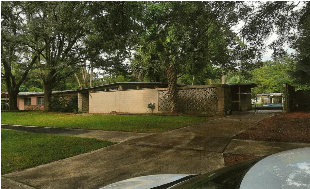
9/8/2021 After Photo taken by Pete Backhaus and accurately reflects the condition of the property at the time it was taken.