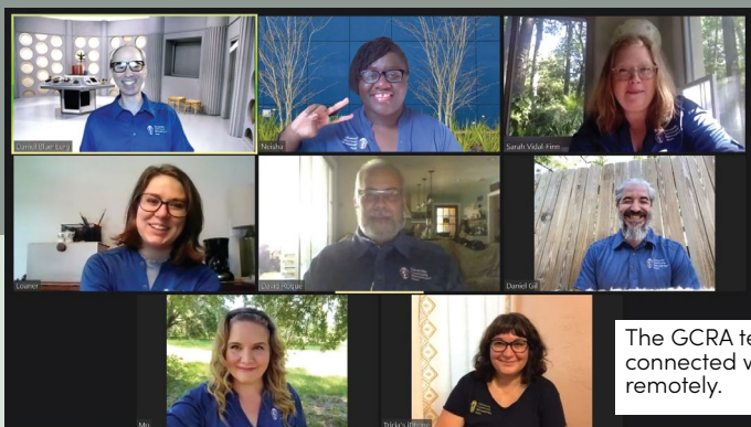
The GCRA team stays connected while working remotely.

The approval of the Reinvestment Plan set a new series of projects and programs into motion. Staff laid the groundwork for building a new suite of residential and economic development programs to better serve the community. Robust interdepartmental collaboration continued on a series of initiatives within the Reinvestment Area.