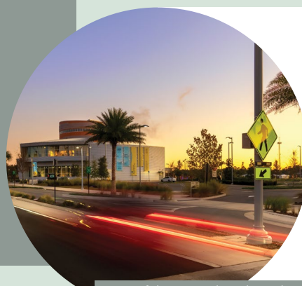
View of the completed northern segment of the South Main Streetscape.

The City of Gainesville’s COVID-19 relief program, GNVCares, provided an opportunity for the GCRA to support the city-wide effort to assist families and businesses that were hardest hit by the pandemic. $165,000 in CRA grant funds were invested in businesses within the district. Of this, $40,000 came from the College Park/University Heights trust fund and the remainder came from the new GCRA fund. The team assisted with promoting the program, answering emails to the GNVCares inbox, and processing applications and payments to businesses.