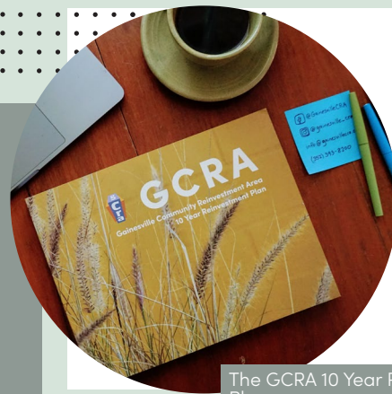
The GCRA 10 Year Reinvestment Plan was approved on March 5, 2020.

GCRA staff adjusted to working remotely by creating procedures and developing new tools to assist with project management. The GCRA Advisory Board’s meetings were shifted to a virtual format to allow for business to continue through the pandemic. The transition to a city department also presented numerous administrative changes in order to align with the City’s policies and procedures.