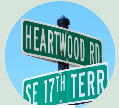
Street sign in the Heartwood Neighborhood.

The remainder of the year was one of transition – to a new structure, remote working and a new work plan. Though many CRA projects were on hold during the Reinvestment Plan development, initiatives that were already underway remained active. Construction began on the model home in the Heartwood neighborhood. Construction of the Innovation District SW 9th Street pedestrian walkway was completed through a public-private partnership. Construction began in partnership with the City of Gainesville’s Department of Parks, Recreation and Cultural Affairs on context area improvements at the A. Quinn Jones Museum & Cultural Center and planning continued on the historic Fifth Avenue/Pleasant Street Heritage Trail.