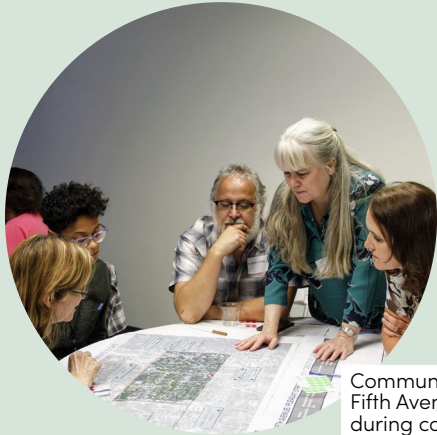
Community members discussing the Fifth Avenue Pleasant Street Area during community engagement for the 10 Year Reinvestment Plan.

Fiscal Year 2020 was a year like no other. The Gainesville Community Redevelopment Agency ceased to exist as a statutory agency and on October 1, 2019 became a department of the City of Gainesville named the Gainesville Community Reinvestment Area (GCRA). The mission of the new department remained the same as its previous iteration: to invest in previously underserved areas of Gainesville; revitalize the urban core; improve the quality of life of our neighbors; and support our small, local and diverse businesses.