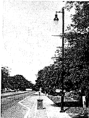
University Avenue – previous improvements include brick paver treatments and renaissance light fixtures.

College Park/University Heights Redevelopment Plan