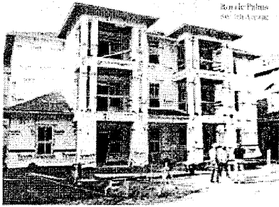
Royale Palms: example of type of new development in the CP/UH Community Redevelopment Area.

The CRA should enhance the environment for private investment through a variety of initiatives that work to eliminate impediments to redevelopment. The following initiatives combined with other proposed improvements within the CP/UH Community Redevelopment Area should improve the investment environment within the CP/UH Community Redevelopment Area.