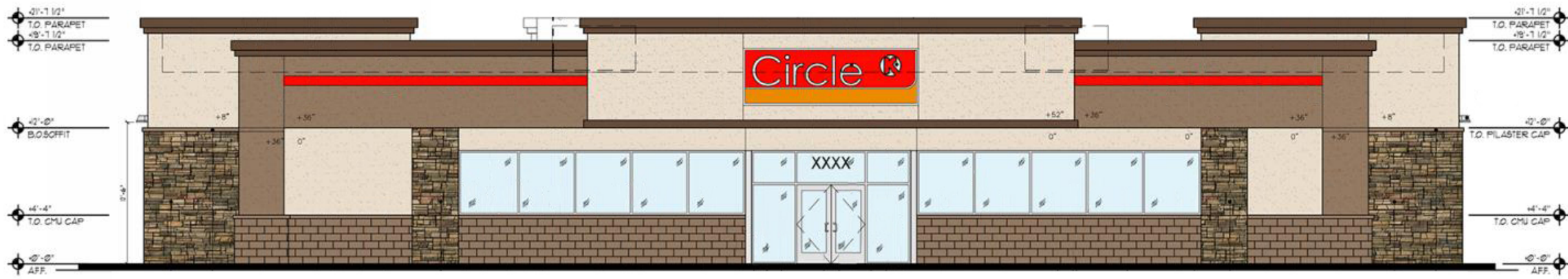
1 SOUTHEAST ELEVATION SCALE: 3/16" = 1'-0"