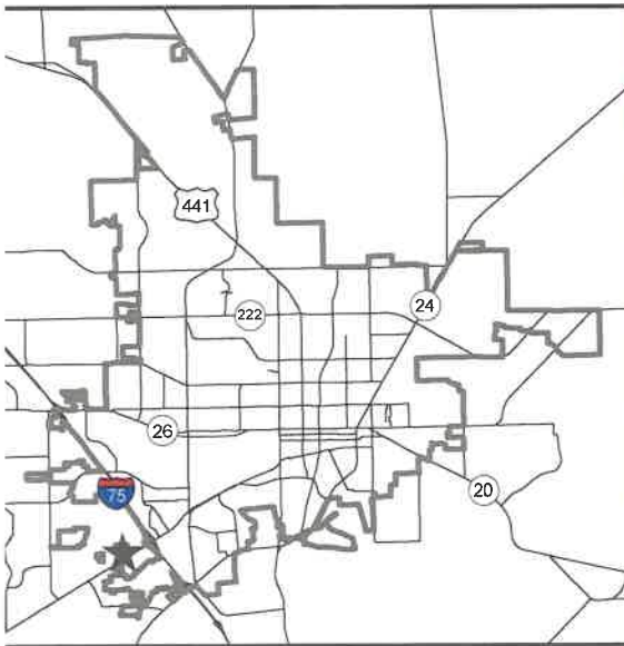
Exhibit B to Ordinance No. 190987