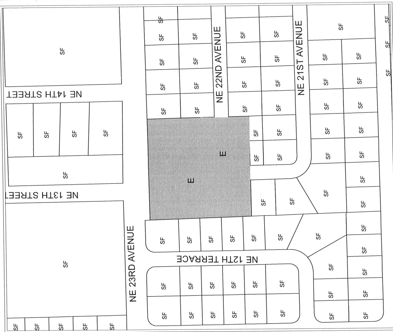
Exhibit "B" to Ordinance No. 120933

SF Single Family (up to 8 du/acre) E Education