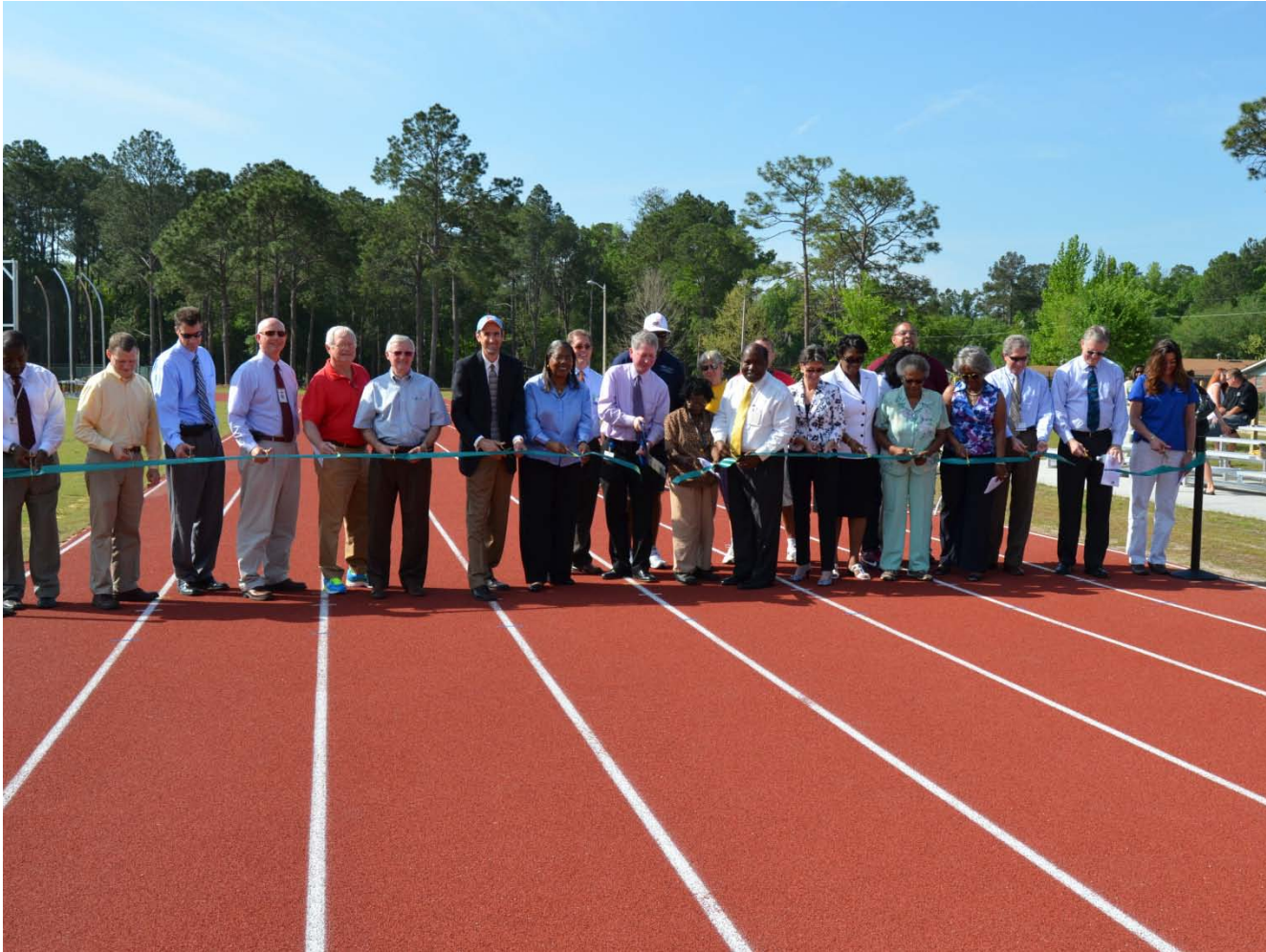
Fred Cone Park Ribbon Cutting