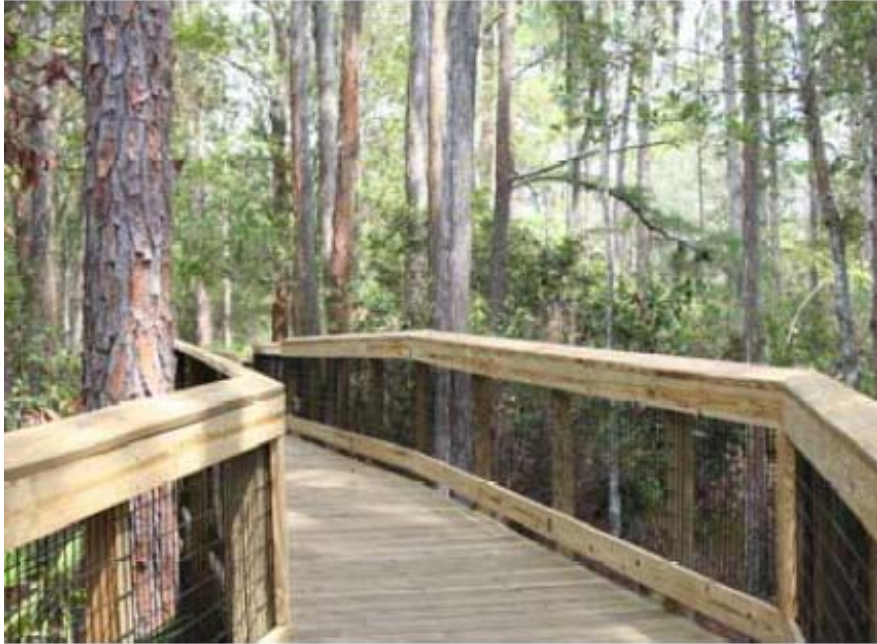
Morningside Nature Center