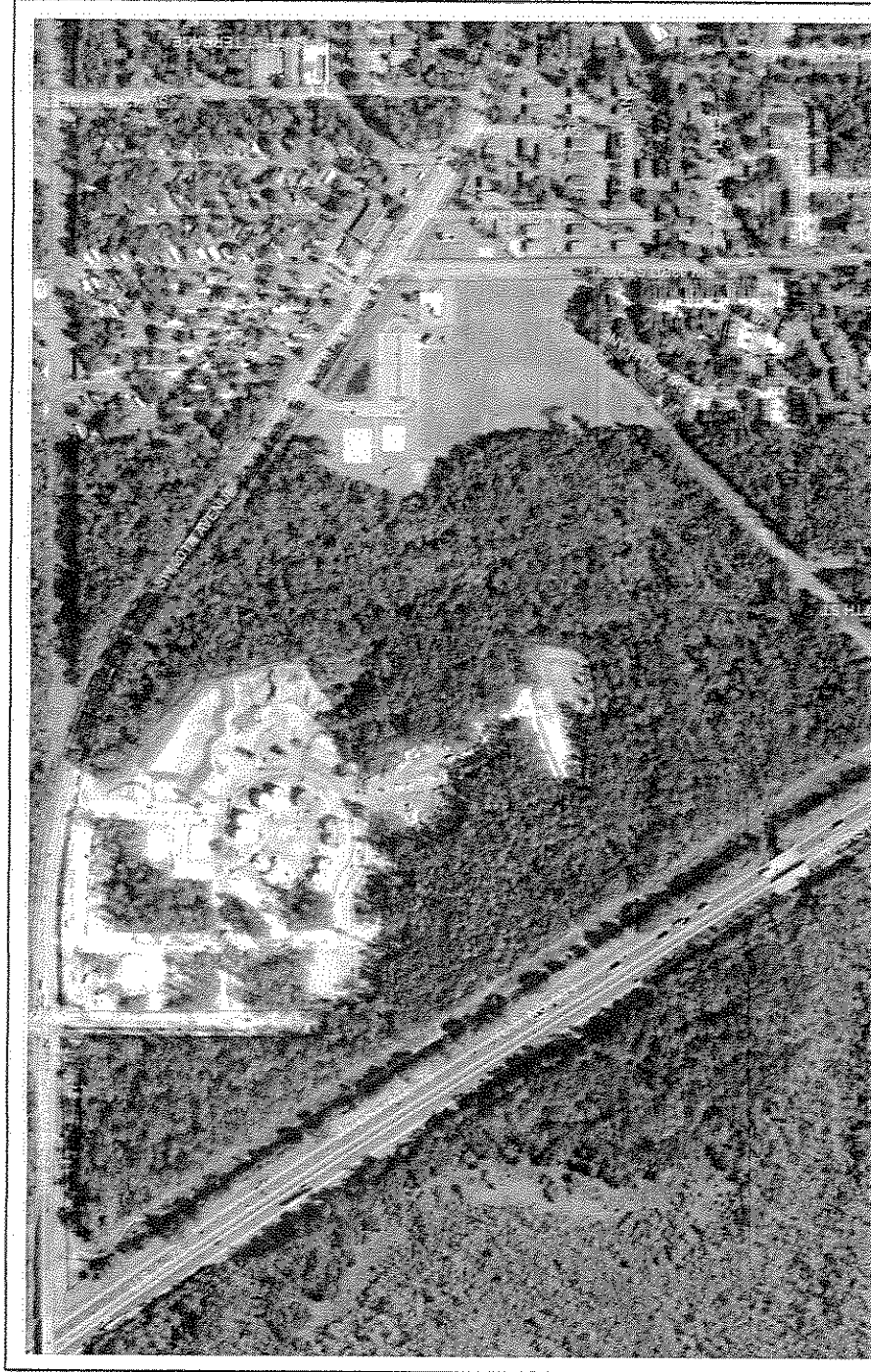
Exhibit B-3 Aerial Map