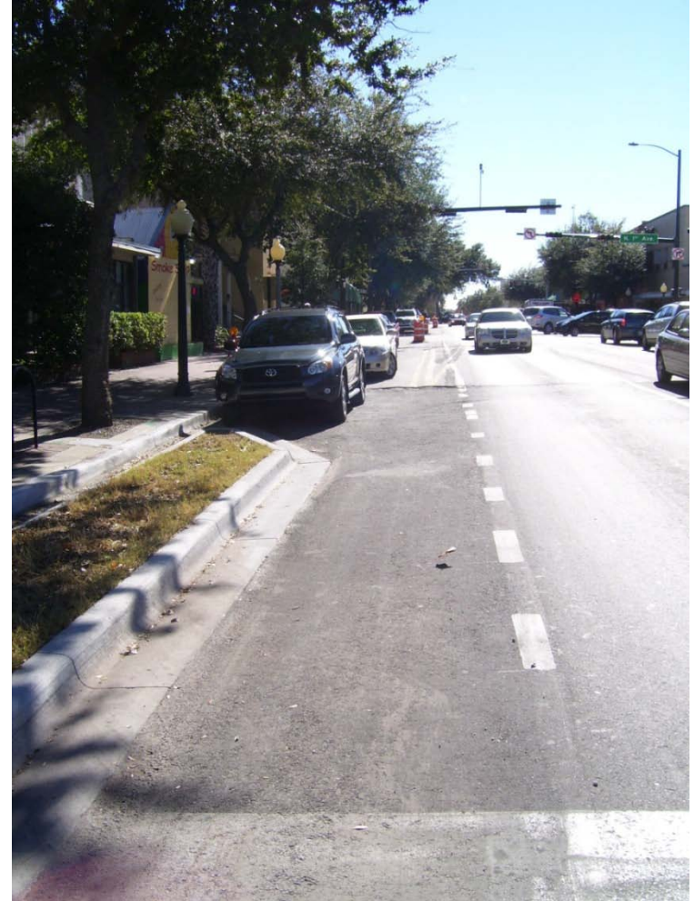
200 N. Main Street