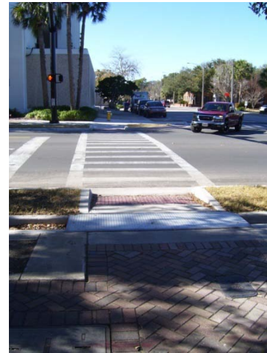
N. Main St. & 2nd Ave