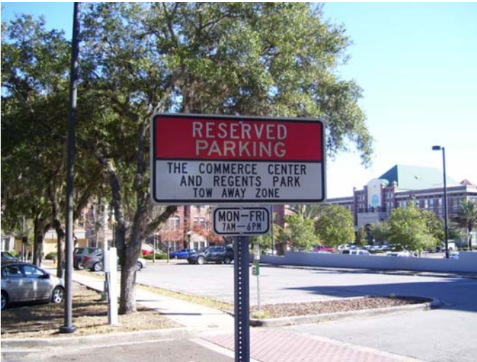
City Hall Upper Lot