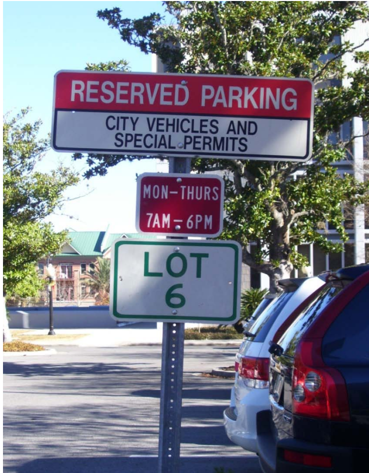
City Hall – Lot 6