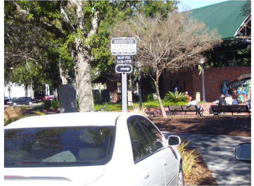
Unit Block – S.E. 1 st Avenue