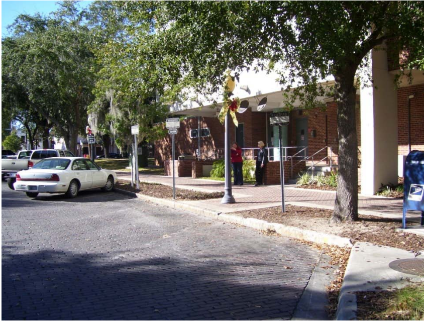
Unit Block – S.E. 1 st Avenue