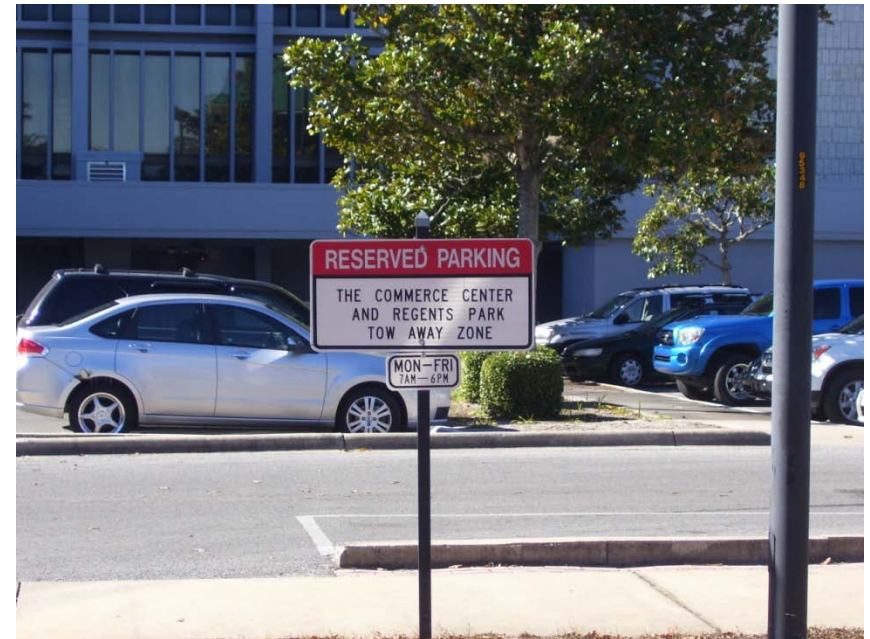
Lower Lot – City Hall