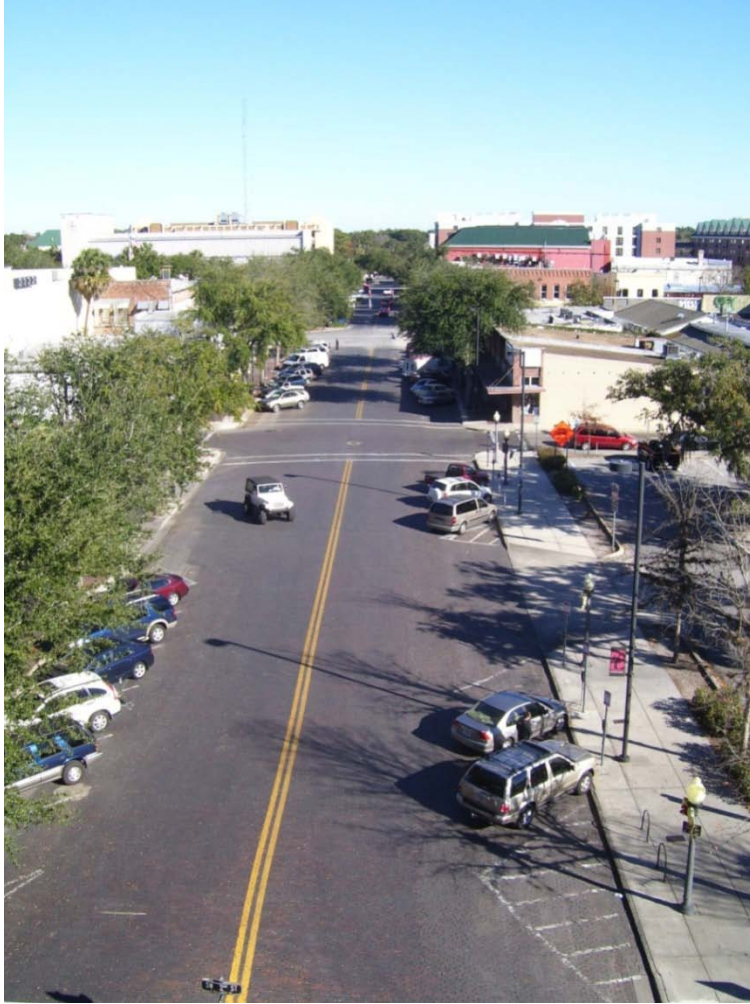
100 S.W. 1 st Avenue