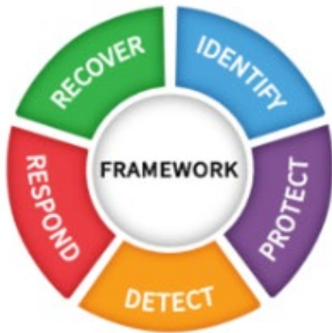
Figure 1- NIST Cybersecurity Framework