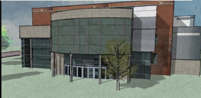
Florida Innovation Hub at UF