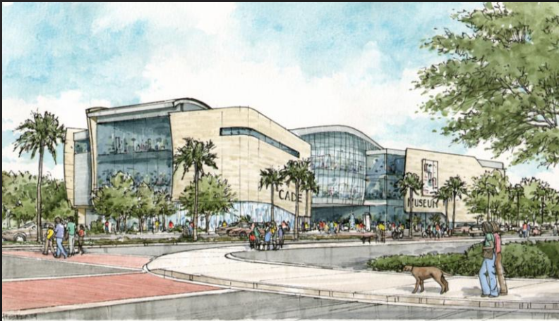
Cade Museum for Innovation and Invention