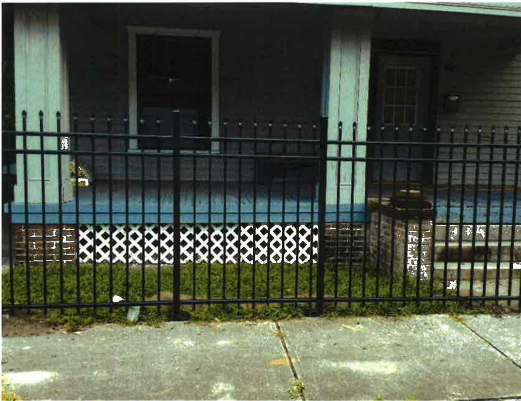
Top: Installed fence at the side yard ends at the existing tree.