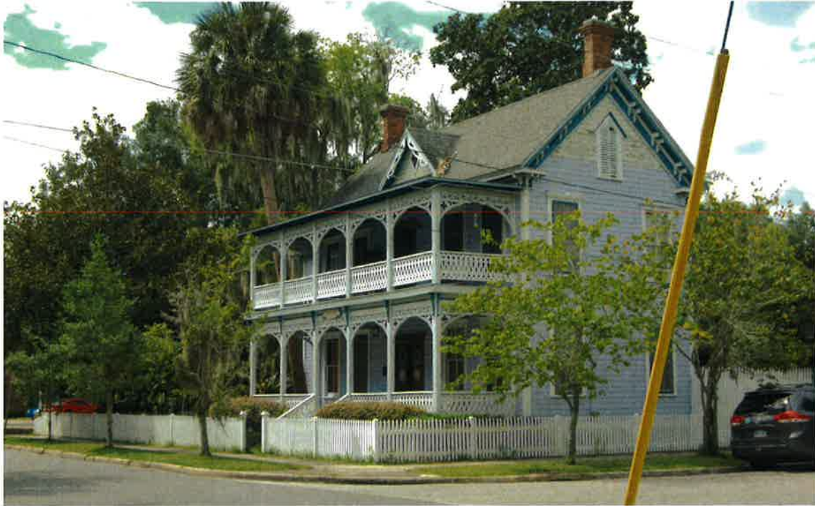
Exhibit 1- Photos