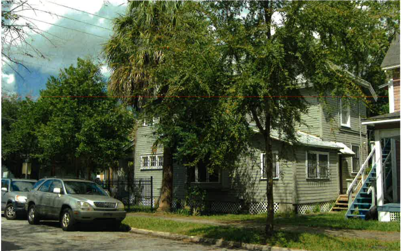
Exhibit 1- Photos