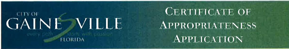
Exhibit 3- COA Application

Planning & Development Services 306 N.E. 6th Avenue Gainesville, Florida 32601 352.334.5022 Fax 352.334.3259 www.cityofgainesville.org/planningdepartment