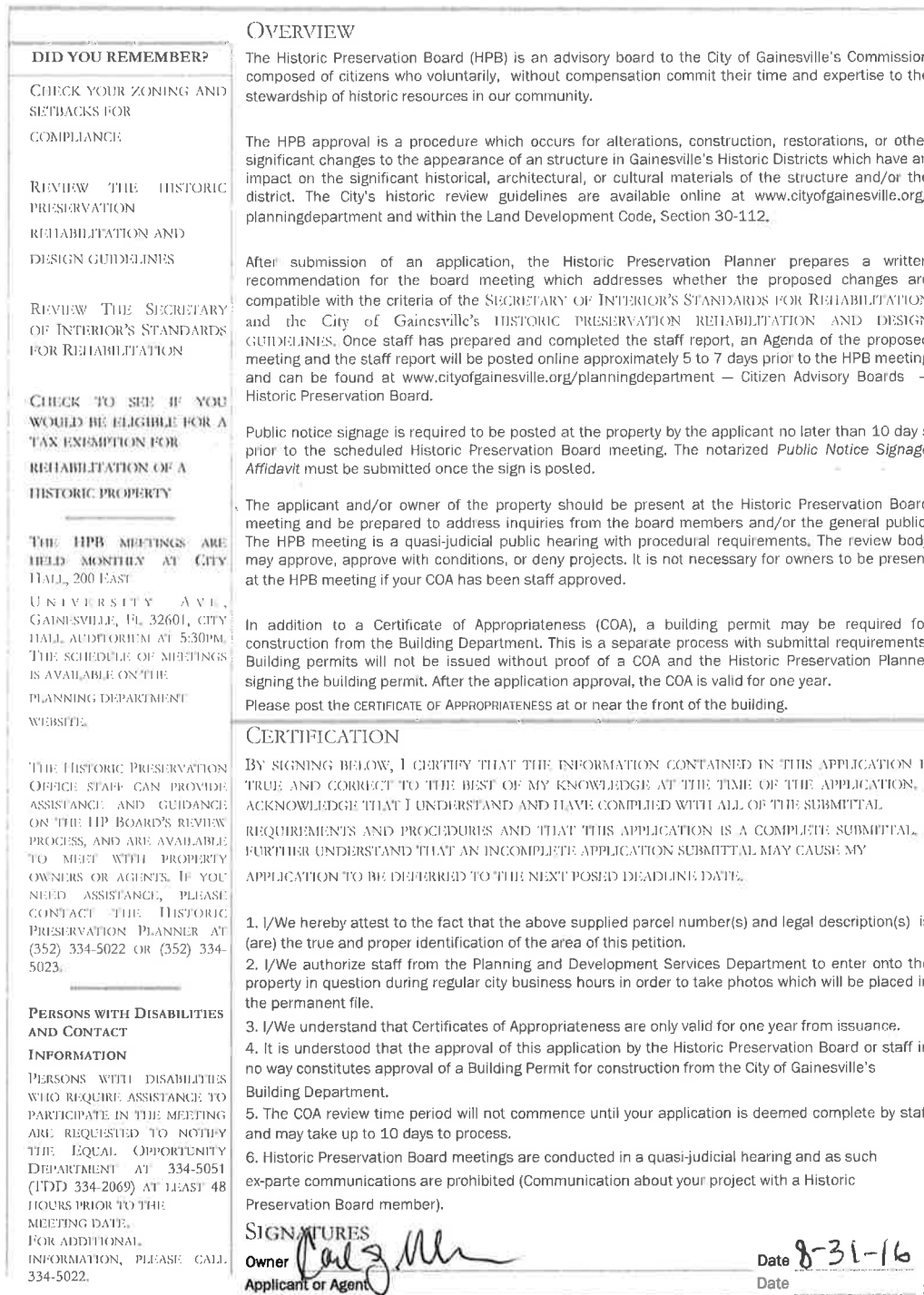
Exhibit 3- COA Application