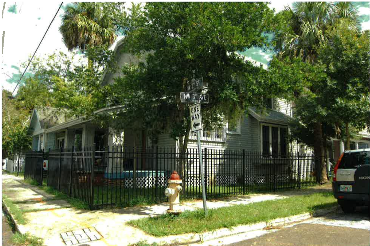
Top & Bottom: Installed fence wraps the corner of the lot.