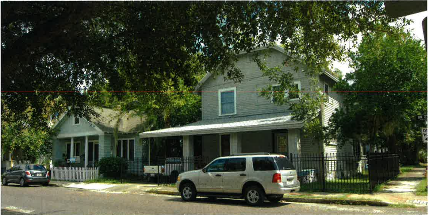
Exhibit 1- Photos