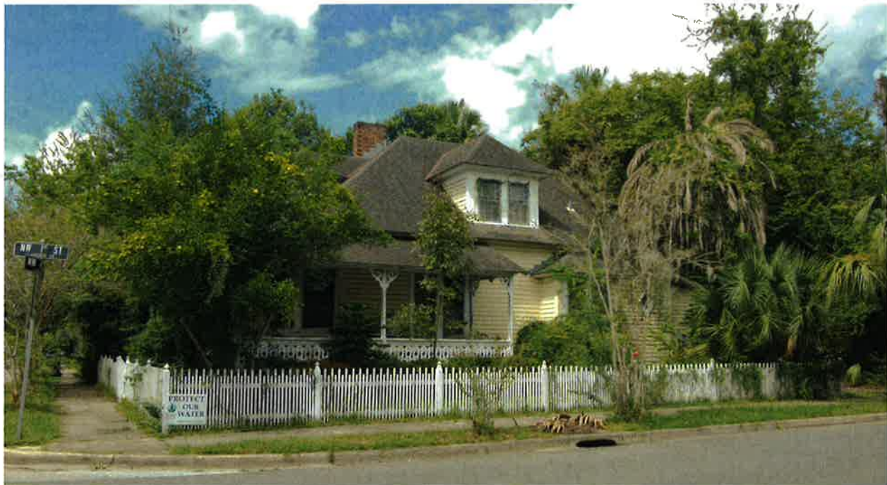
Top & Bottom: Houses within a three-block radius have low wood picket fences.