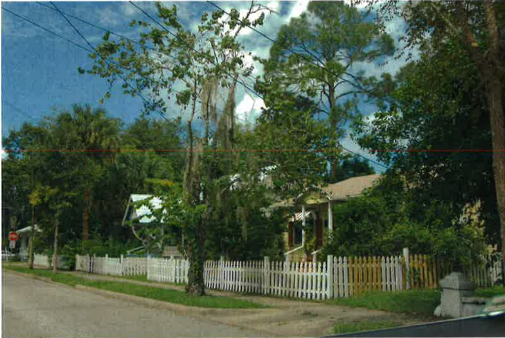
Exhibit 1- Photos