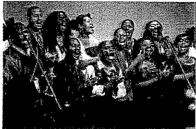
The UP Gospel Choir performs during the Gathering for Peace at Trinity United Methodist Church in Gainesville on Sunday.