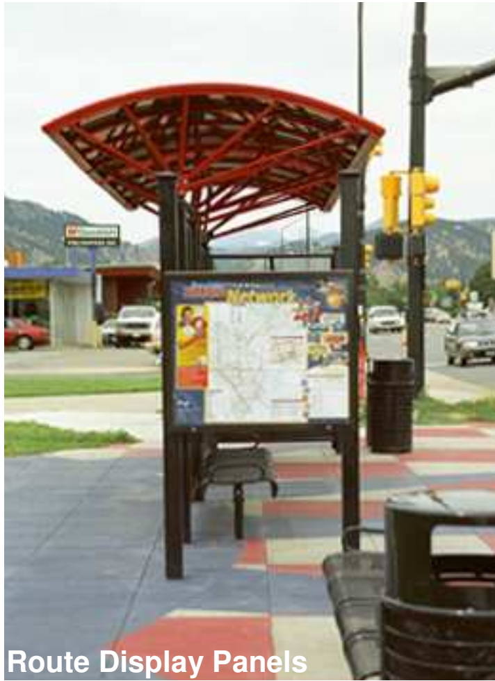
Route Display Panels