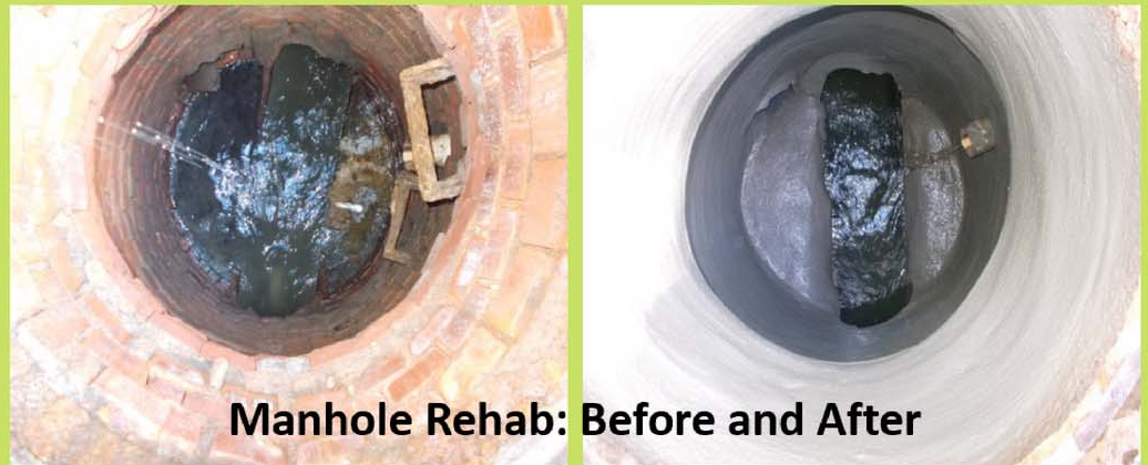
Manhole Rehab: Before and After