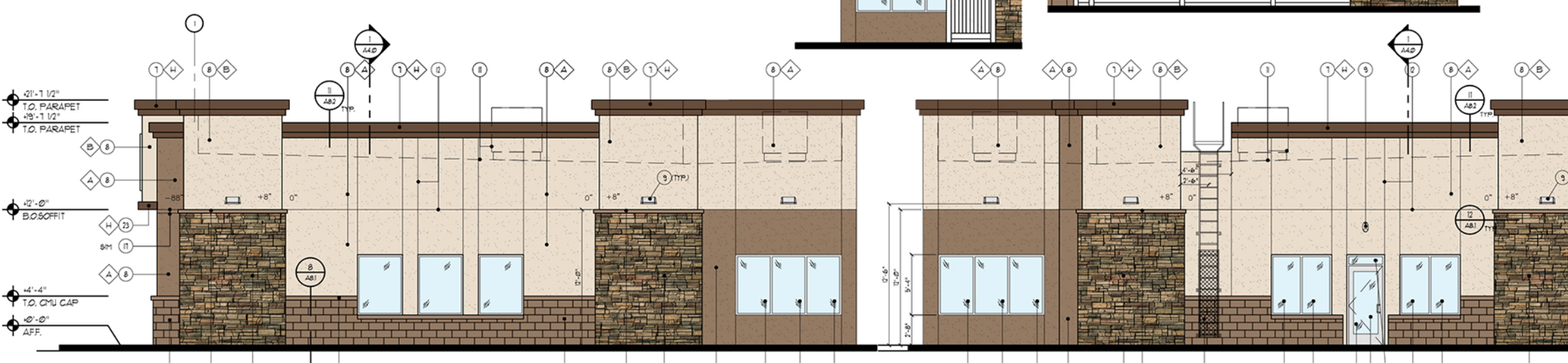
3 NORTHEAST ELEVATION SCALE: 3/16" = 1'-0"

WALL AREA & GLAZING AREA: WALL AREA BETWEEN 3'-0" = 580 SQ FT 25% OF WALL AREA = 145 SQ FT TOTAL GLAZING SQ FT = 150 SQ FT