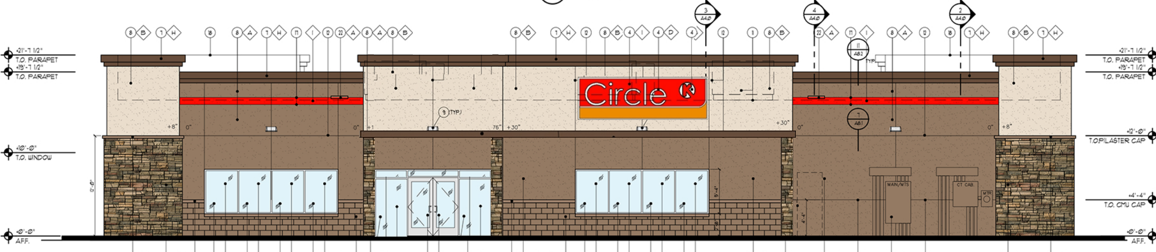
2 NORTHWEST ELEVATION SCALE: 3/16" = 1'-0"

WALL AREA & GLAZING AREA: WALL AREA BETWEEN 3'-0" = 580 SQ FT 25% OF WALL AREA = 145 SQ FT TOTAL GLAZING SQ FT = 150 SQ FT