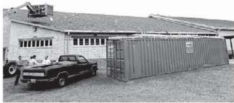
Workers plan before going up on the roof of Kanapaha Middle School on Feb. 12 in Gainesville.