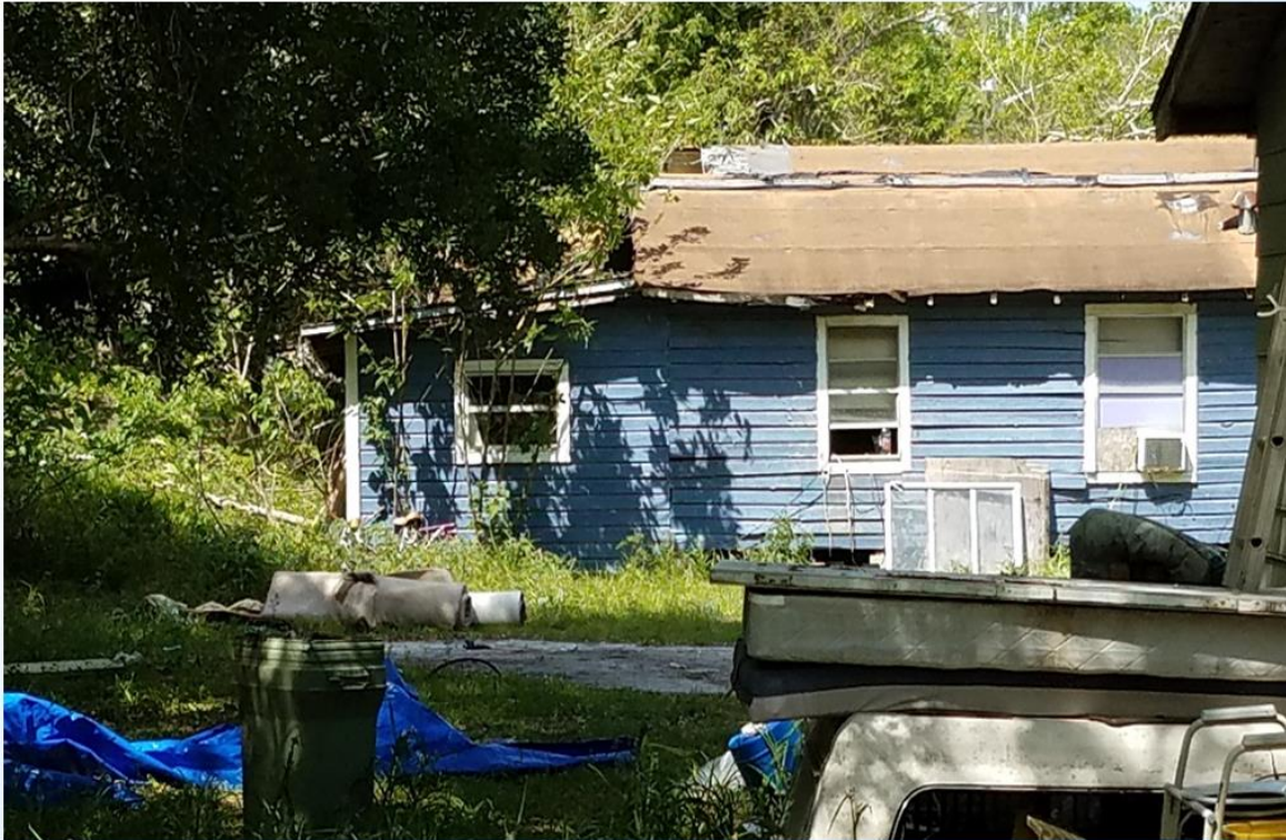
03/29/2018 - Before Photo(s) taken by Steven Baker and accurately reflected the condition of the property at the time it was taken.