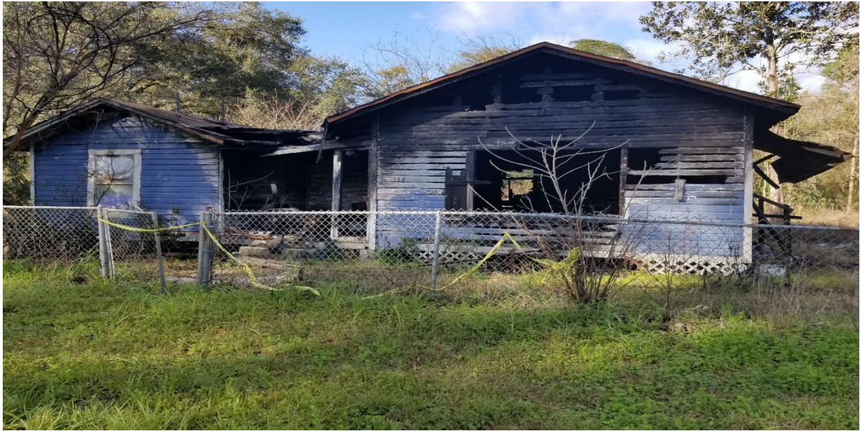
03/29/2018 - Before Photo taken by Nicole Lardner and accurately reflected the condition of the property at the time it was taken.