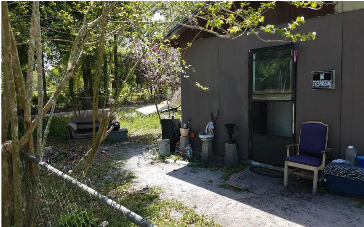
03/29/2018 - Before Photo(s) taken by Steven Baker and accurately reflected the condition of the property at the time it was taken.