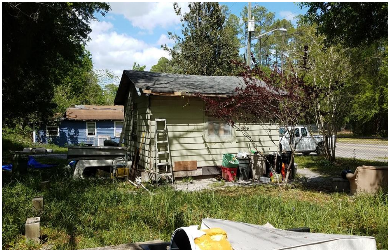
03/29/2018 - Before Photo(s) taken by Steven Baker and accurately reflected the condition of the property at the time it was taken.