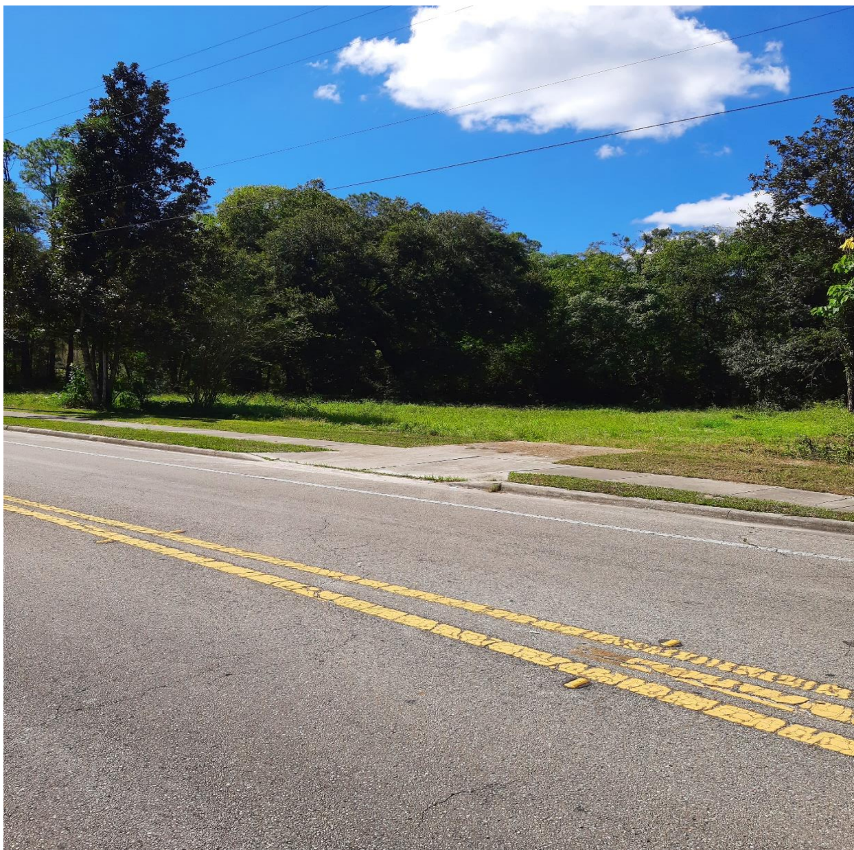
10/13/2021 – After Photo was taken by Pete Backhaus and accurately reflects the condition of the property at the time it was taken.