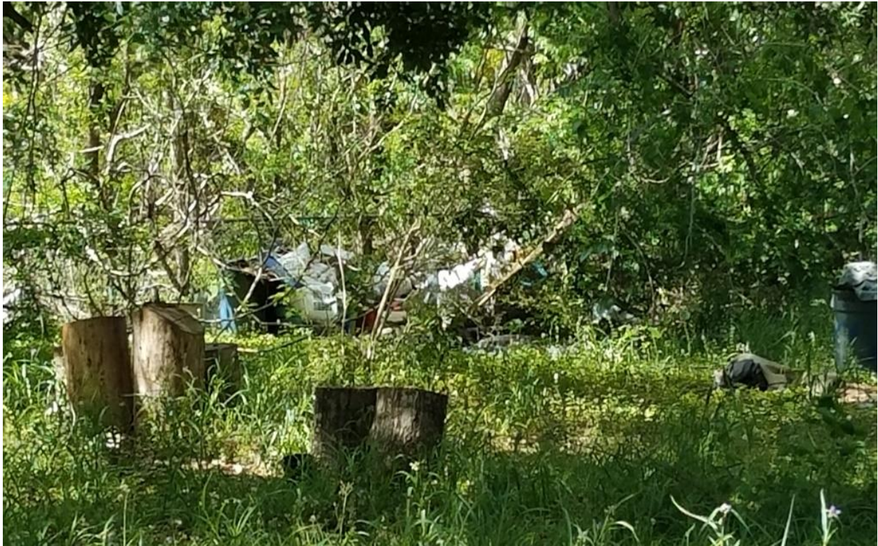
03/29/2018 - Before Photo(s) and accurately reflected the condition of the property at the time it was taken.