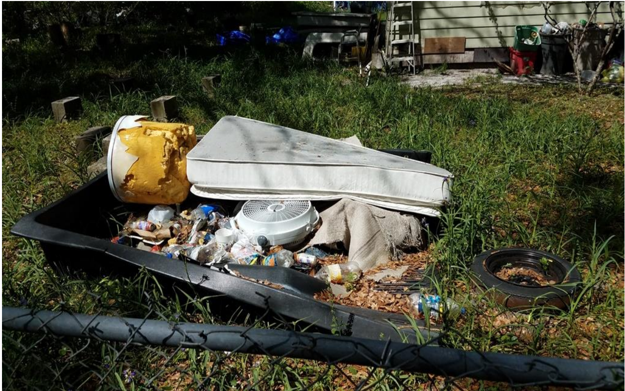
03/29/2018 - Before Photo(s) taken by Steven Baker and accurately reflected the condition of the property at the time it was taken.