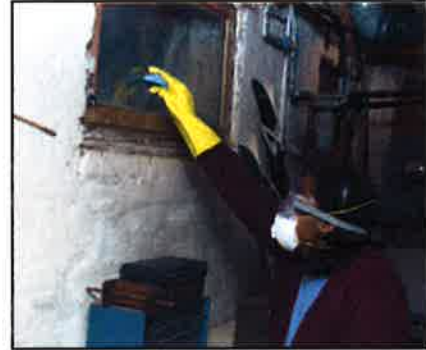
Cleaning while wearing N-95 respirator, gloves, and goggles.