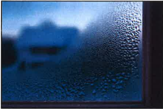
Condensation on the inside of a window-pane.

■ Keep indoor humidity low. If possible, keep indoor humidity below 60 percent (ideally between 30 and 50 percent) relative humidity. Relative humidity can be measured with a moisture or humidity meter, a small, inexpensive ($10-$50) instrument available at many hardware stores.