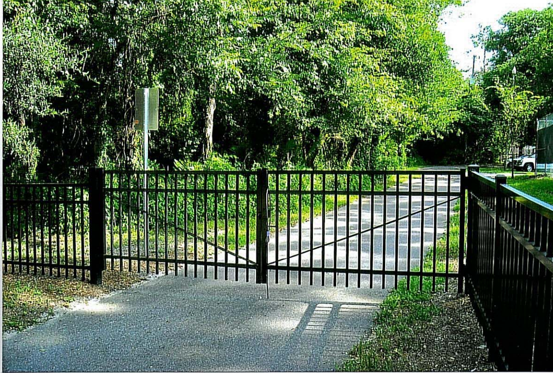
Attachment 1: Existing Industrial Aluminum Fence (north border)