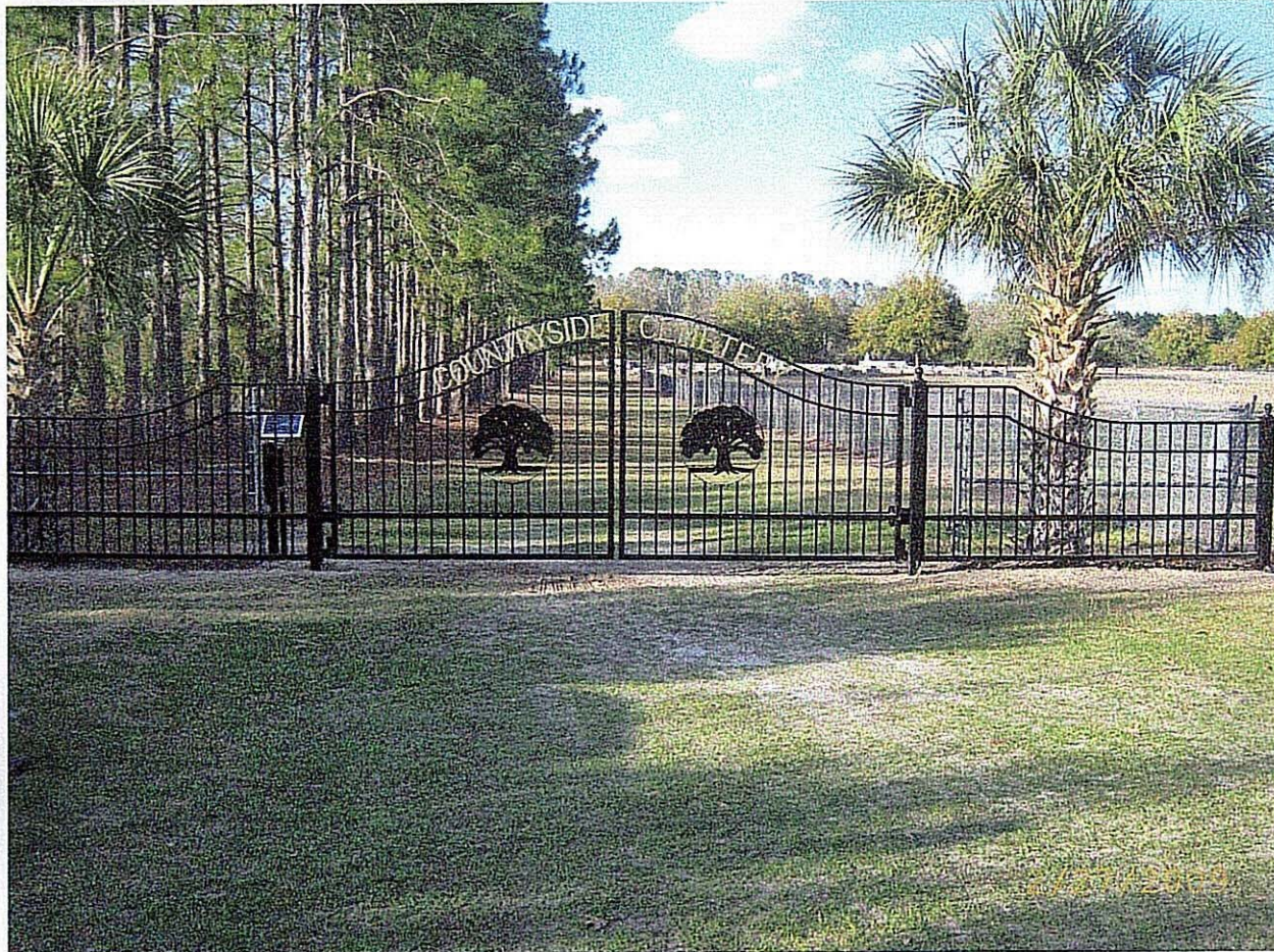
Attachment 2: Example of Ornamental Gate (Countryside Cemetery)