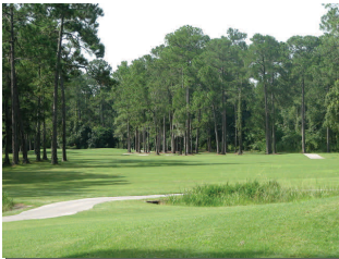
Ironwood Golf Course

The Stormwater Management Fund is used to account for the costs associated with maintaining, replacing and/or expanding the City's stormwater-related infrastructure and is funded by user fees. There are two parts to Stormwater Management funds; one being the operation and management of Stormwater facilities and the other being the capital projects involved with replacing and/or expanding stormwater facilities. This report concentrates on the operations fund which is projected to end FY2017 with a deficit of approximately $125,000. The year-end projections for this fund still leave this fund in good financial health, with total net assets of $29M.