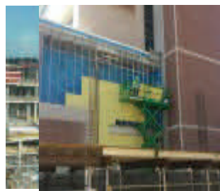
Panels are removed to allow the new hospitals to connect to the UF Health Shands Cancer Hospital.

This fund is used to account for the cost of operations of the City-owned public golf course. Year end projections for FY2017 anticipate revenues to come in about 2% below budget. Expenses are projected to come in at about at budget. The current plan is to roll this fund into the General Fund in FY2019 as a recreation program.