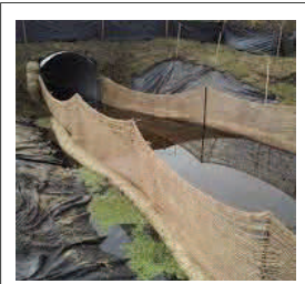
Paynes Prairie restoration

Enterprise Funds are used to report activities where a fee is charged to an external user and where that fee is intended to primarily cover the cost of providing that service. The sections that follow include a financial synopsis of the City's Enterprise Funds.