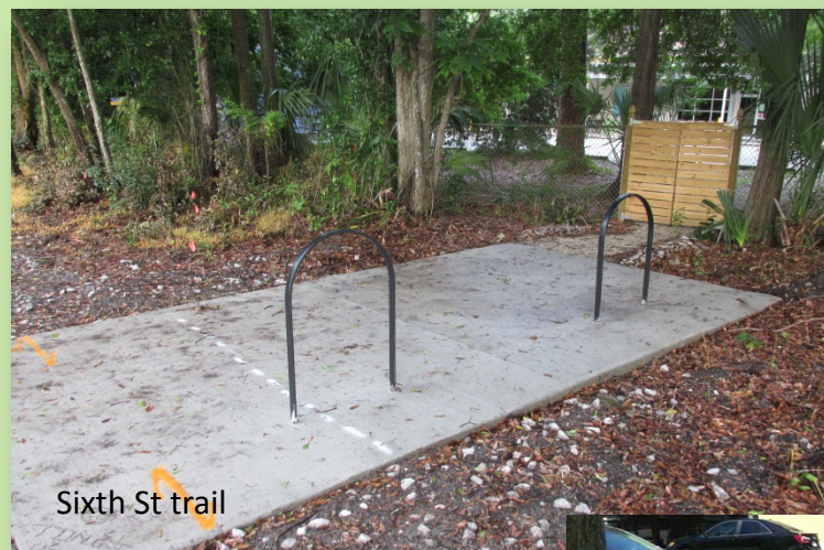
Sixth St trail