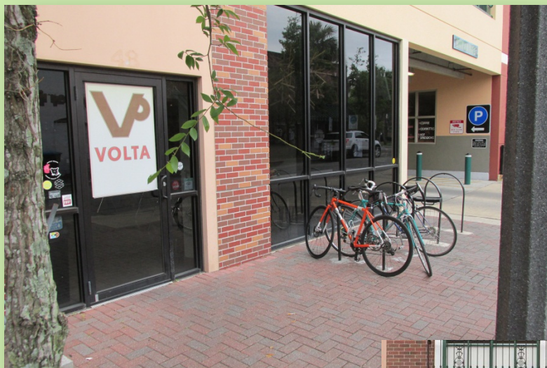
Downtown Parking Garage SE 2 nd St