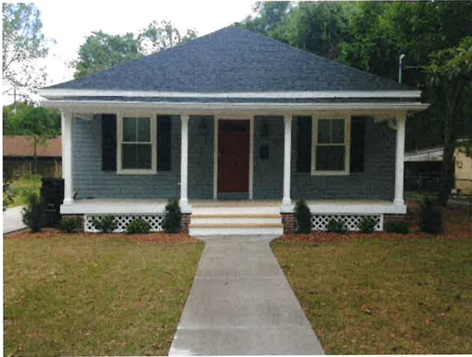
Exhibit 2 - Photos