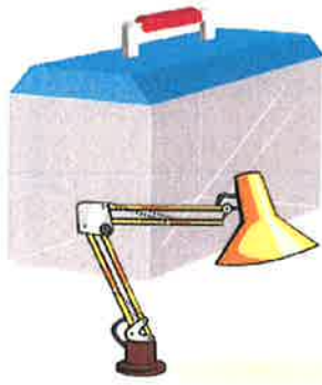
Sun Lamp + Research Kit