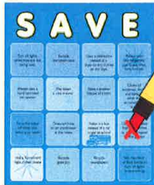
Dry Erase BINGO / SAVE Game Card + Marker