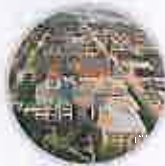
Excerpts from the state of Massachusetts plan of Ohio and Wisconsin Fast Forward

The State of Wisconsin's $30 million investment in the Wisconsin Fast Forward (WFF) grant program is a nationally recognized, innovative talent development solution driven by Wisconsin businesses to train and retain highly skilled workers. Over $18 million in WFF grant contracts has been issued to date, supporting nearly 200 worker training projects and benefiting hundreds of employers and thousands of workers across Wisconsin. 4