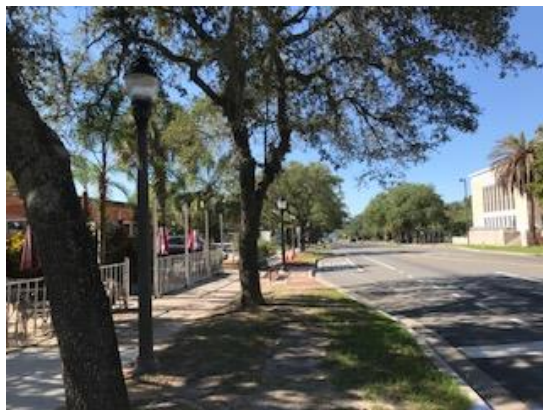
S. Main Street (Bus Stop Removal, 5m Loading Zone Opportunity)