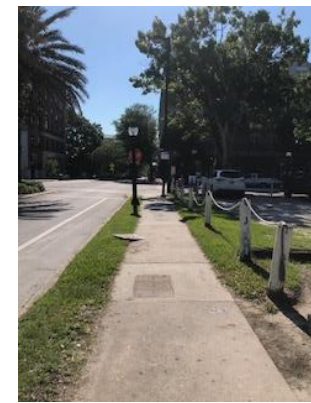
SE 1 st Avenue (Landscape and Hardscape)