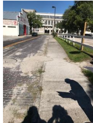
SE 2 nd Place (Potential One-way Segment, Stormwater/Roadway Issues, Crosswalk to Hipp Opportunity)