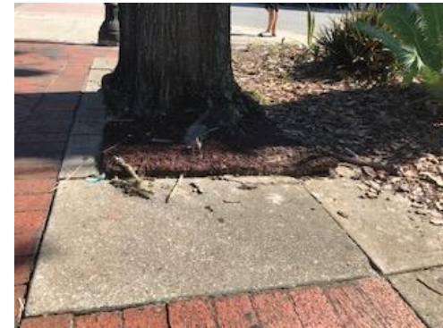
SE 1 st Street (Across from Union Station)