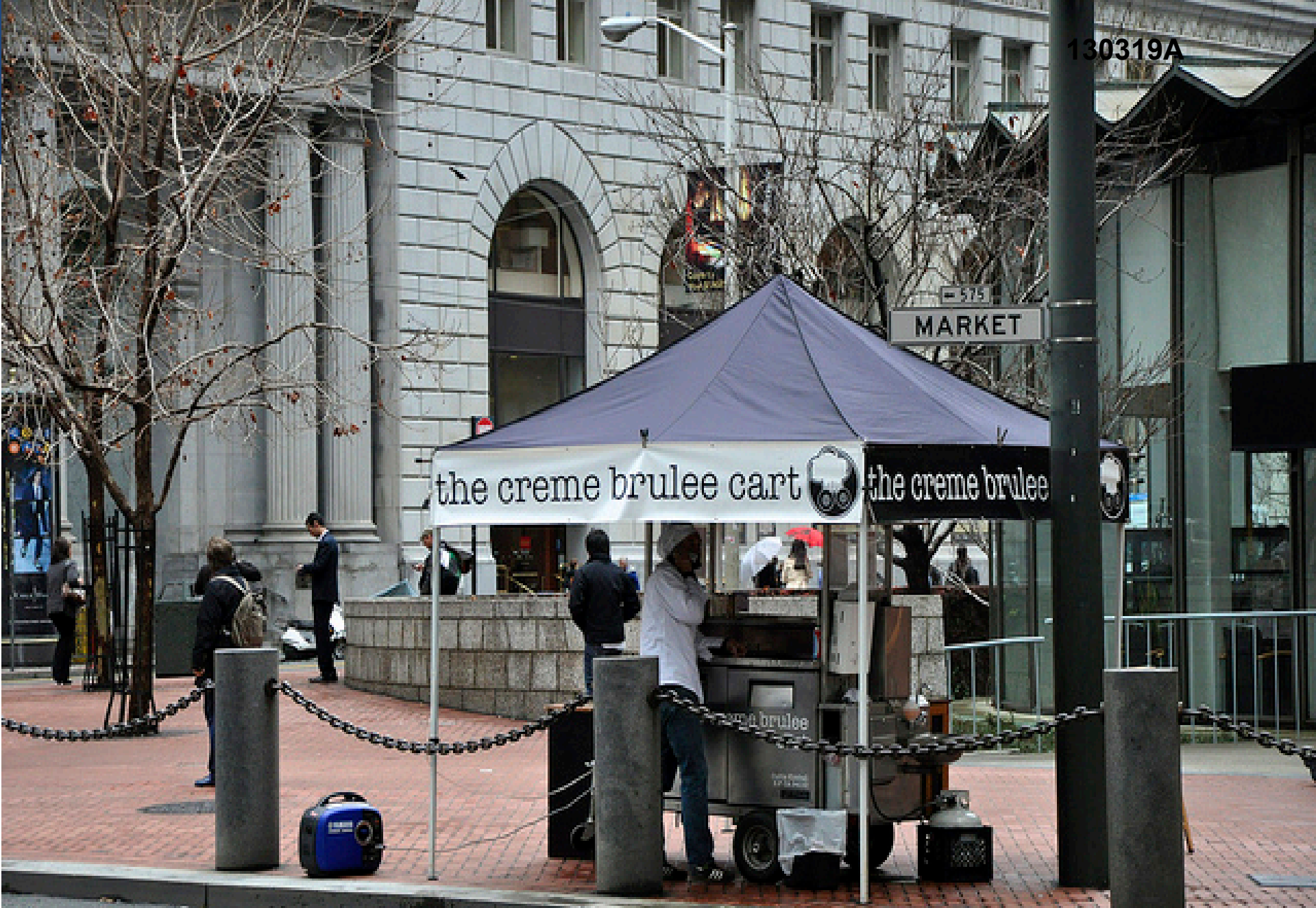
A Vending Booth (Allowed only at designated locations)