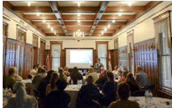
The 352ArtsRoadmap was a year-long process, informed by a wide cross-section of the community.

Nearly 3,197 area residents have helped shape this plan.