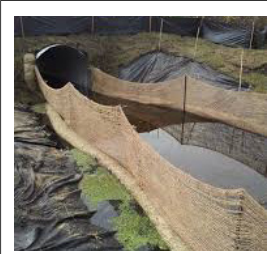
Paynes Prairie restoration