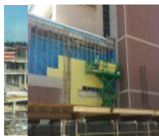
Panels are removed to allow the new hospitals to connect to the UF Health Shands Cancer Hospital.

This fund is used to account for the cost of operations of the City-owned public golf course. Year end projections for FY2017 anticipate revenues to come in 2.95% or about $38,000 above budget. Expenses are projected to come in about 9% or $140,000 over budget. The current plan is to roll this fund into the General Fund in FY2020 as a recreation program.