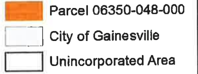
Exhibit "A" to Ordinance No. 171037 page 2 of 2