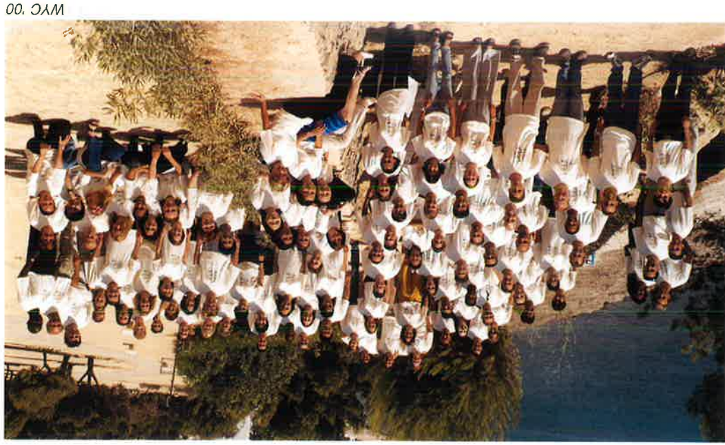
«La Tribune» - Québec

Quebec organizes the session of the WYC in Sherbrooke thanks to the local foundation for Economic and Cultural Development. Concerts are performed in Quebec and Ontario.