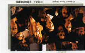
Best Selection 90-96