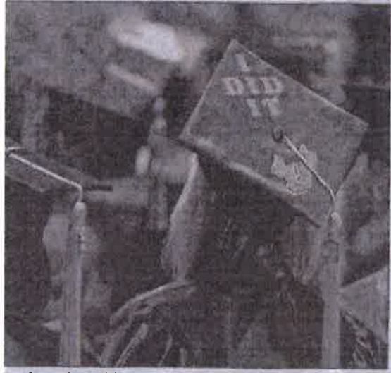
ly of South Florida Sarasota-Manatee's graduates participating commencement exercises at the Bradenton Area Union Center in Palmetto, Fla., on Monday, May 5, 2014.... 30 USF Sarasota-Manatee seniors who have applied to... at the spring 2014 commencement, about 190 attended... money. This number includes 42 master's degree candi-... d 286 bachelor's degree candidates from the Colleges of... sciences, Business, Education, Hospitality and Technology... ip and the USF Tampa College of Behavioral and Com-... sciences.