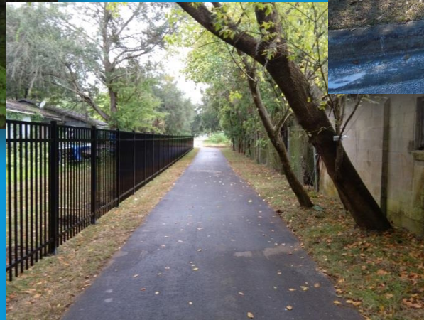
SW 2 nd St Connector