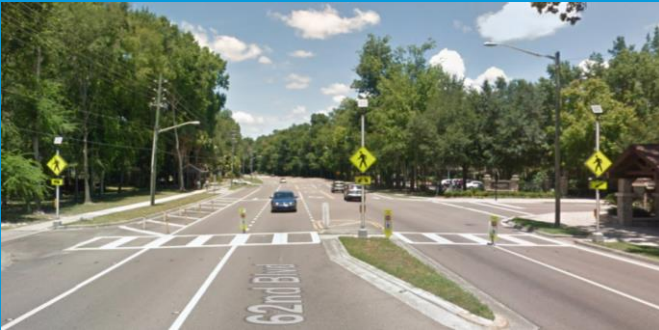
Pedestrian activated midblock crossing