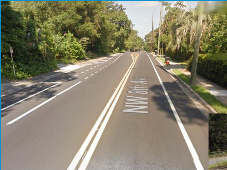
NW 8 th Ave