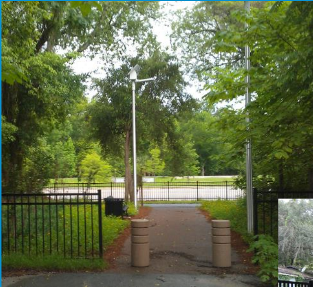
Sixth St Trail Connector