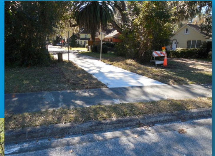
SE 2 nd Ave Connector