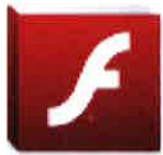
Adobe Flash Player

The Granicus Portable Encoder is military grade and strong enough to work in any video encoding environment. With a sound output less than 40db, the Granicus Portable Encoder is considerably quieter than standard off-the-shelf encoding hardware.