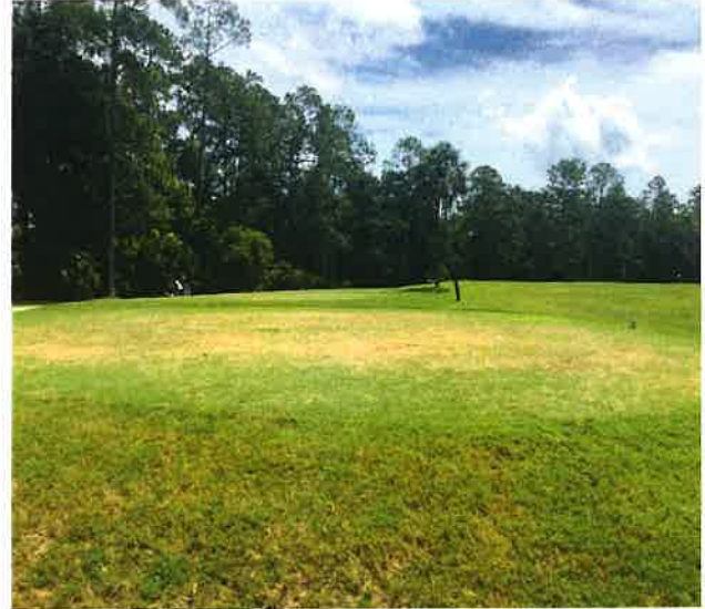
Dry areas on the course

Pest Control Program(s) – A variety of weeds and pests are expected on TifDrawf bermudagrass putting greens in Central Florida, including but not limited to: weeds, diseases, insects and nematodes. BVGM has included Integrated Pest Management (IPM) strategies to control these pest via the proper timing and placement of preventative and curative control products. A few examples: 1) preventative fairy ring applications are based upon soil temperature models of when the disease becomes active; 2) first generation mole cricket applications are timed based upon the scouting and identification of egg-laying females and presence of newly hatched nymphs. This allows for a single application of a properly timed insecticide for maximum control.