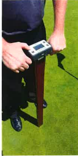
Field Scout TDR 300 Moisture Meter