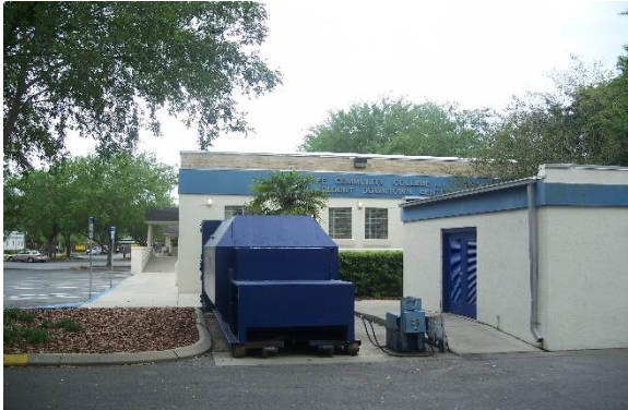
Santa Fe College.