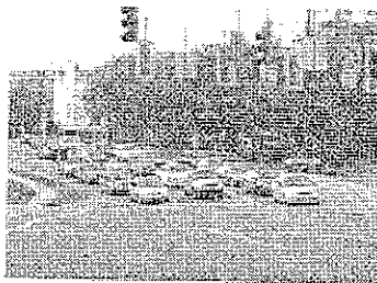
Traffic at the busy intersection of Archer Road and 13th Street