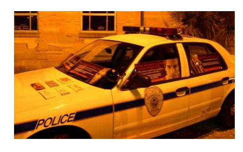
Gators Mobile SAFE-T Kiosk

GPD's Community Conflict Coordinator conducted seven conflict mediations. The mediations involve citizens, police, business owners and neighborhood associations and are designed to mitigate repeat neighborhood issues before they escalate to a level of law violation.