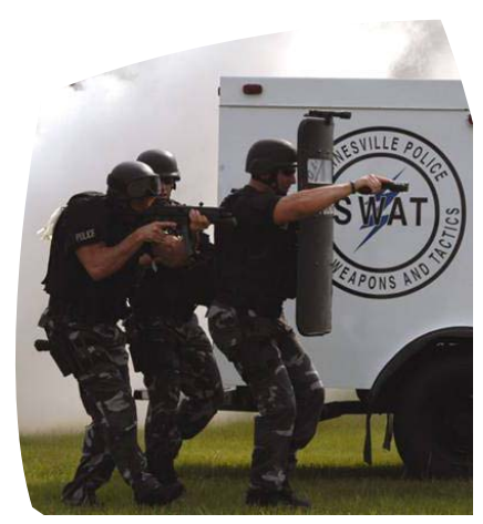
GPD SWAT Team

During the quarter, GPD hired 2 police officers, one Police Service Technician (PST) and