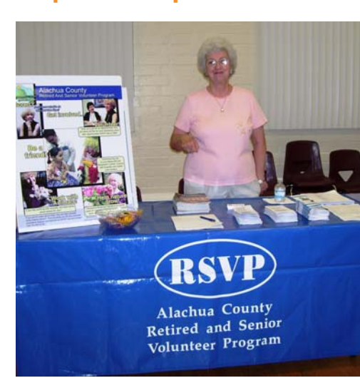
Booth at 2008 Senior Health Fair

During the third quarter, the following progress was made on Senior Services: