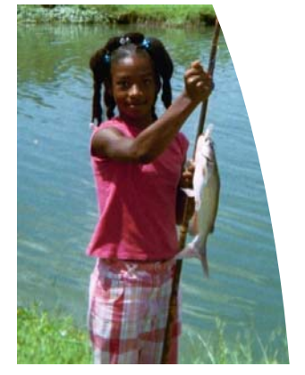
Camper goes fishing at 2008 Summer Camp

have 70 girls, Summer Camp scholarships went to 150 children, and the Summer Basketball League received over 300 registrations, but had to cap enrollment at 240 girls and boys. Operation Respect Yourself held an End of School Year Pool Party at the NE Pool in conjunction with the Mike Peterson Football Camp at Citizens Field and MLK Center serving over 400 youth on June 27th. An End of Summer Pool Party is scheduled for August 15 at Westside Pool. The MLK Center has remained open all summer for Open Gym from 12 Noon to 5 PM daily and has been well utilized by all age groups.