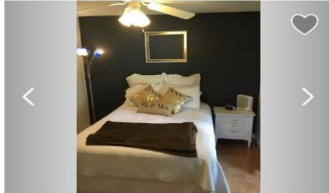
$136 ↕ Comfortable Gainesville Getaway Entire townhouse · 3 beds ★★★★★ 28 reviews

Only 21 listings left for these dates. We recommend booking a place soon.