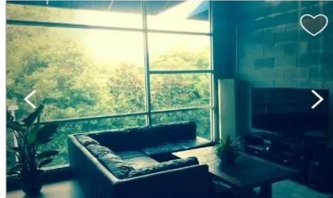
$227 🏠 Huge 3/3.5 loft near UF, Shands! Entire condominium · 3 beds ★★★★★ 33 reviews