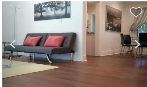
$237 ↕ Historic & Modern 3/2 Home by UF Entire house · 3 beds ★★★★★ 30 reviews