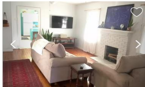
$122 🏠 Historic Bungalow near UF Entire house · 3 beds ★★★★★ 25 reviews