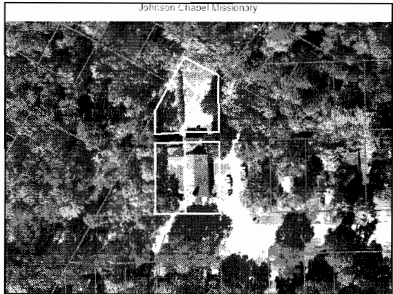
Johnson Chapel Missionary