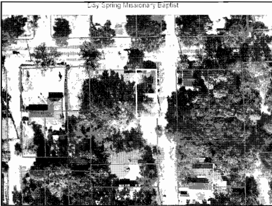
Day Spring Missionary Baptist