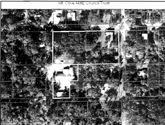
Mt Olive A.M.E Church Trust