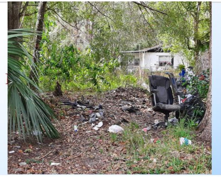
\frac{11/9/20}{-} Photo was taken by <u>Sam Norris</u> and accurately reflected the condition of the property at the time it was taken.

Code Enforcement Division CITY v. SMALLS & SMALLS & SMALLS HEIRS 826 NE 18^{TH} Ter / Tax Parcel No. 10733-054-000 CE-20-01913 / 2020-116