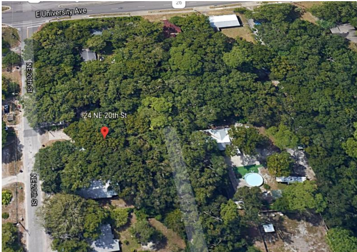
Map(s) of Property Location