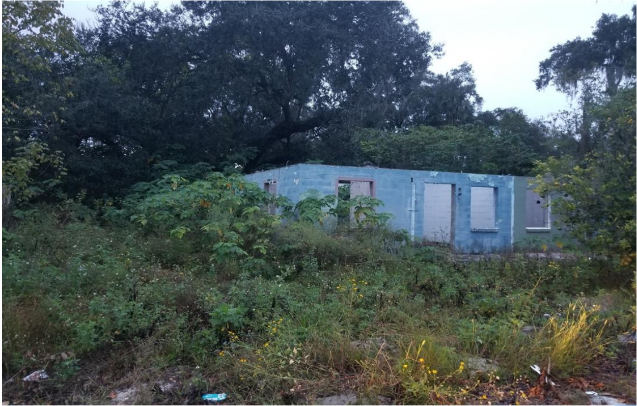
10/21/20 - Before Photo taken by Nicole Lardner and accurately reflected the condition of the property at the time it was taken.