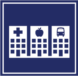
Goal 1: Equitable Community

MISSION Gainesville city government’s mission is to build community by providing services responsive to neighbors and our community in a financially responsible and neighbor-focused manner in partnership with our neighbors while engaging neighbors and community builders.